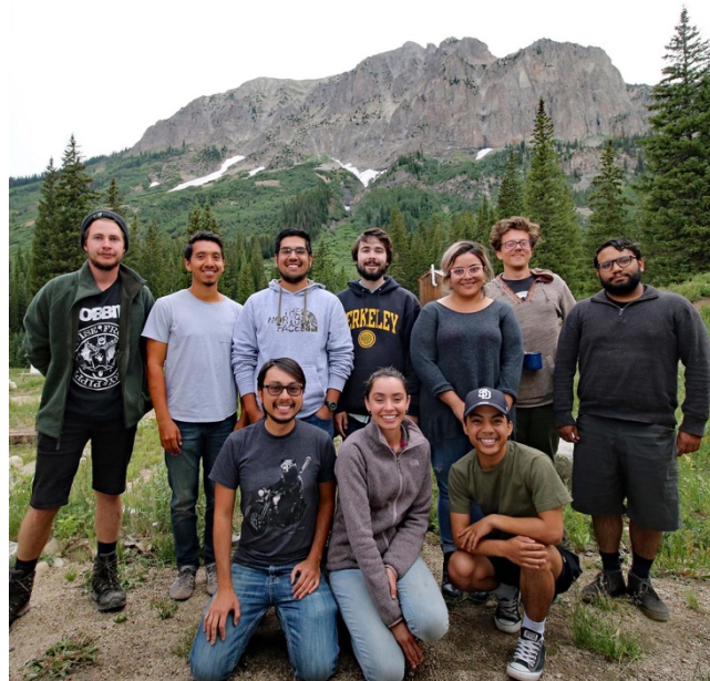
Community College Students and Alumni (now Professor) at the Rocky Mountain Biological Laboratory, Gothic Colorado. All are from the Greater Los Angeles area. The middle students in both top and bottom rows are from Chaffey. 2017